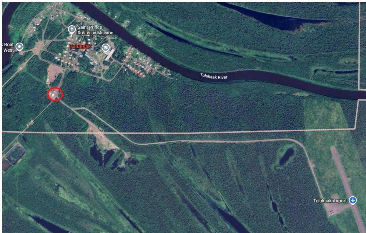
Approximate location of generator