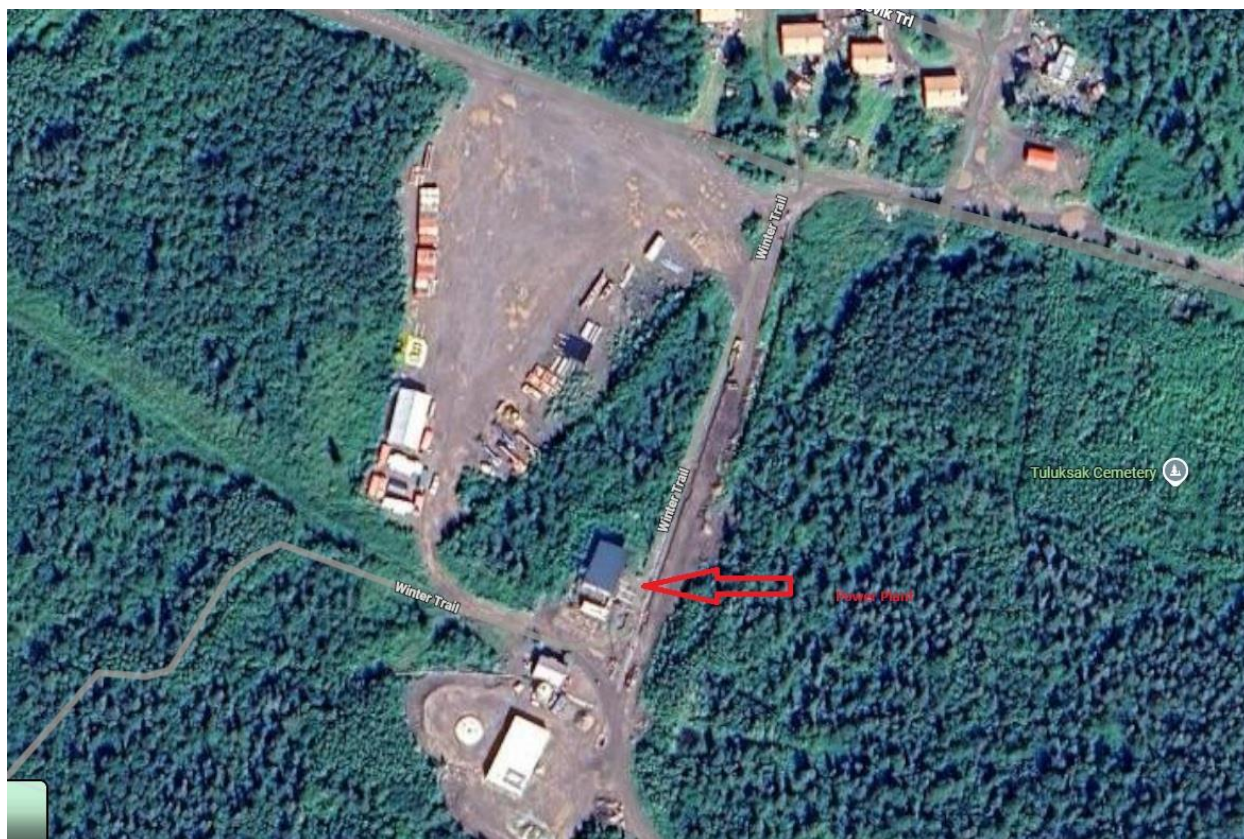
Close up of previous picture. Red arrow shows the power plant.